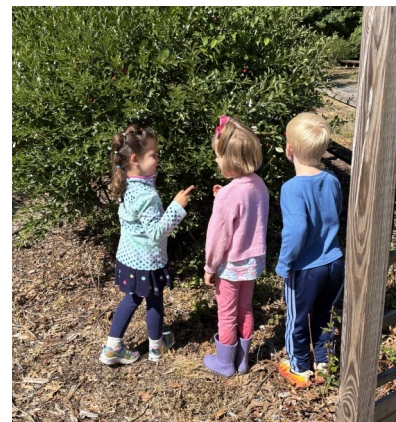
Pictured: Trinity preschoolers at a May field trip to Bellemeade Park! Exploring the worm garden (left) and harvesting/eating fresh cherries (right)