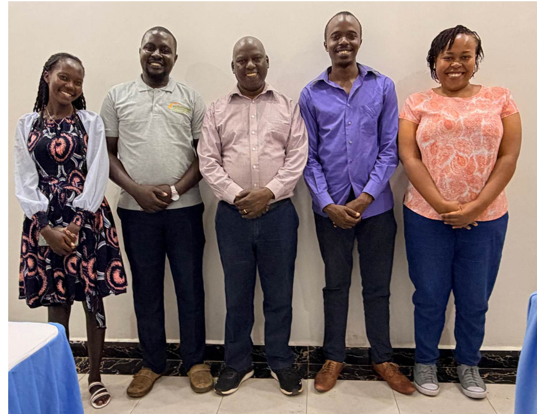
The Executive Director with the Interns Cohort-2026