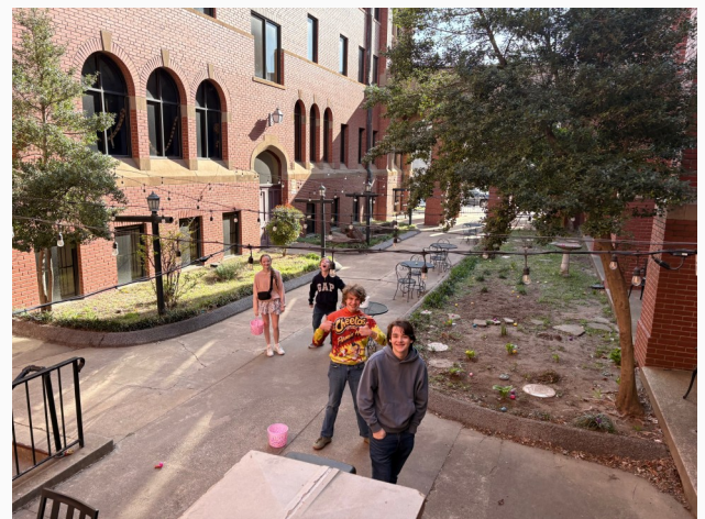
Youth hiding the eggs