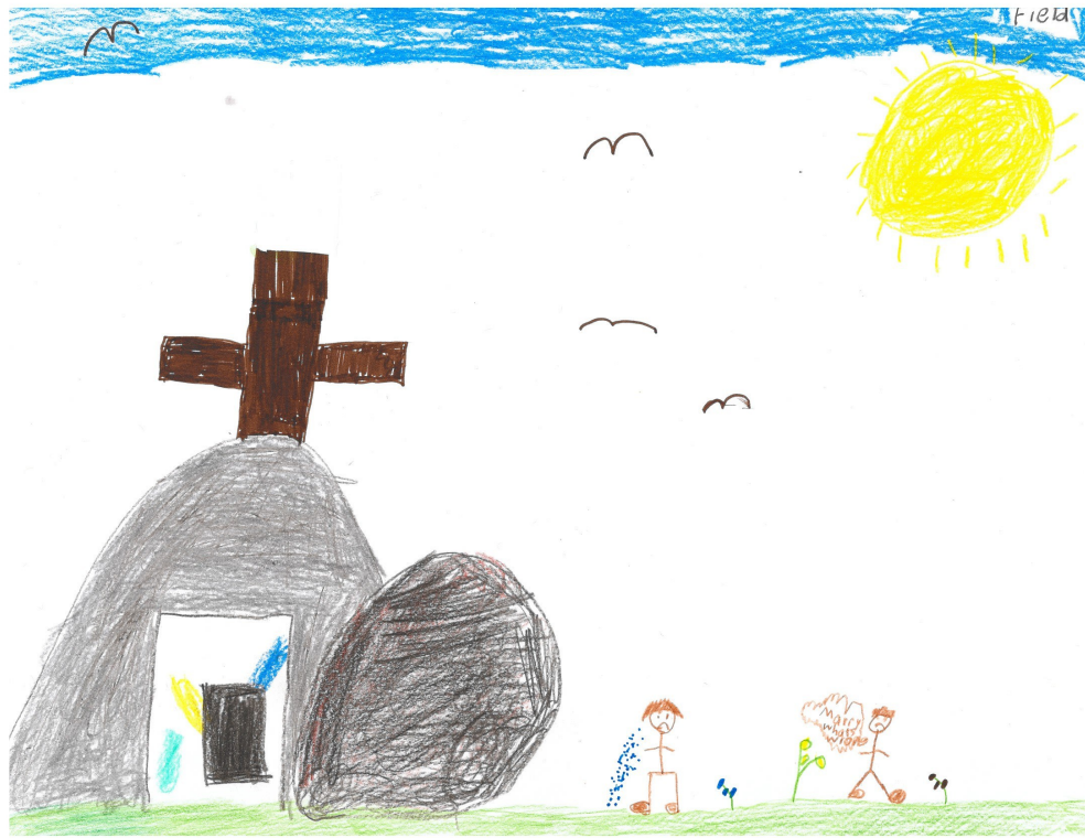
Art by: Field Griswold, age 10