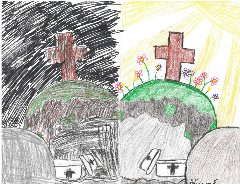
Art by: Adi Eichler, age 10