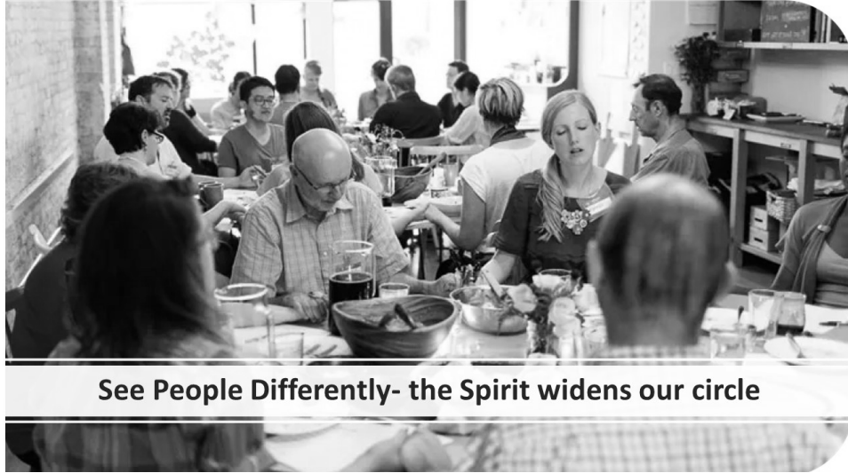
See People Differently- the Spirit widens our circle