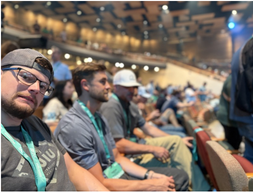
The whole staff will be at camp this summer that will awesome!

I have the retreat planned for May 15-16, please be at the building after school we will leave as soon as everyone arrives between 4:30 p.m. and 5 p.m. Please bring a sleeping bag or some blankets. We are trying to cut down on the number of sheets we have to wash afterwards, which usually takes up a lot of time. We have a full schedule planned for the retreat and would like to leave time for hiking