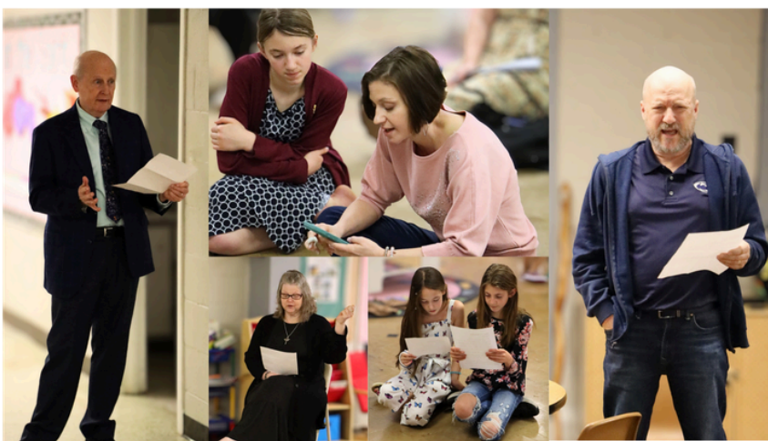
(Above) The cast gathers in Fellowship Hall to hold rehearsals where each cast member recites their character’s monologue. “The Living Easter” features twelve stations with twelve different character’s attesting to the miracles, signs, and wonders of Jesus Christ throughout His ministry, trial, and crucifixion.