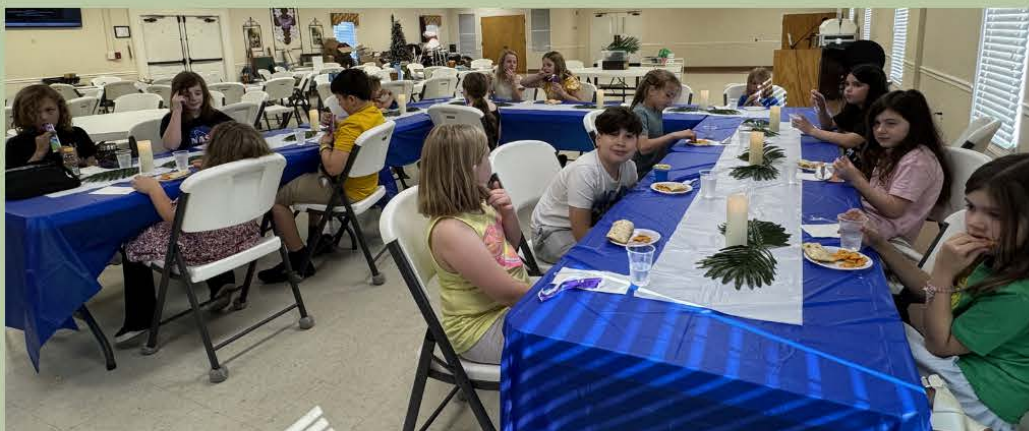
Pictured Left: TeamKID often has special activities to bring to life our Bible lessons and special holidays.