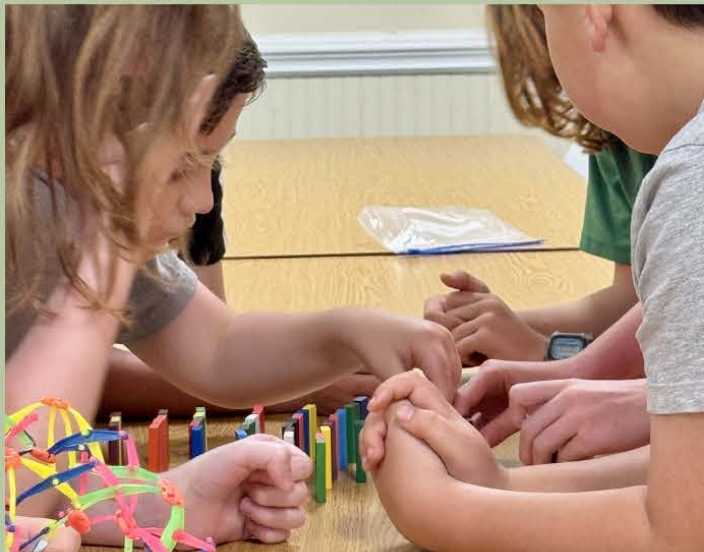
Pictured Above: TeamKID learning about the domino effect of sharing Jesus with others.