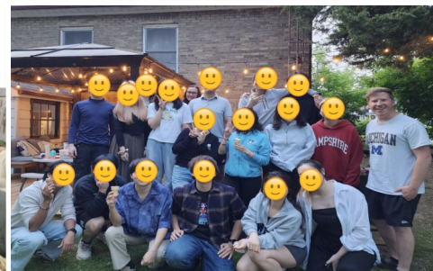
Typical weekly "Explore Nights" at the Medlers!