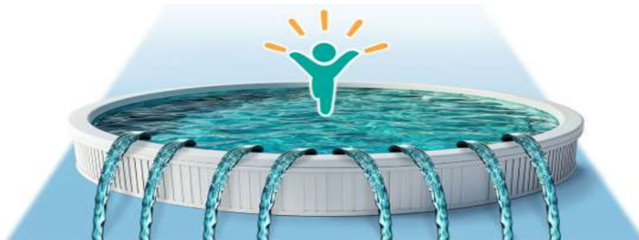
Funding for the Entity

That Pool of Funding is filled by advertisers, corporate grants, private endowments, wise investments, plus a portion of the funding SeYah receives from every fundraiser.