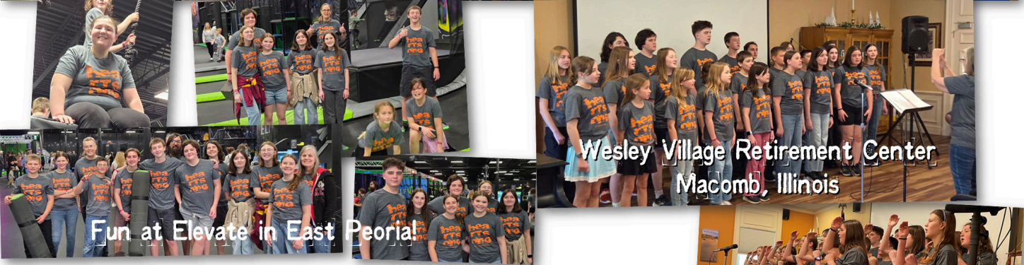
Wesley Village Retirement Center Macomb, Illinois