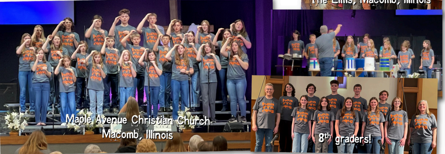
Maple Avenue Christian Church Macomb, Illinois