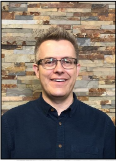
Laurin Hill Worship Ministry