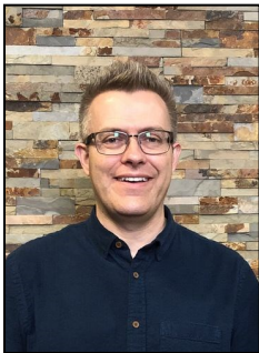
Laurin Hill Worship Ministry