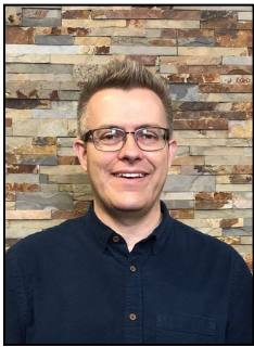
Laurin Hill Worship Ministry