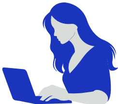
Jochebed: The Mother with a Plan