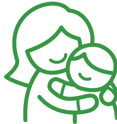
Leah and Rachel: The Mothers Who Had to Share