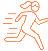
Hagar: The Mother Who Endured