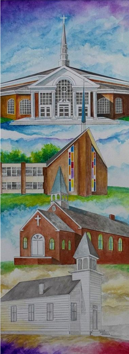
Minnieville Road 2006-Present

Proclaiming Christ One Hundred Fifty Years