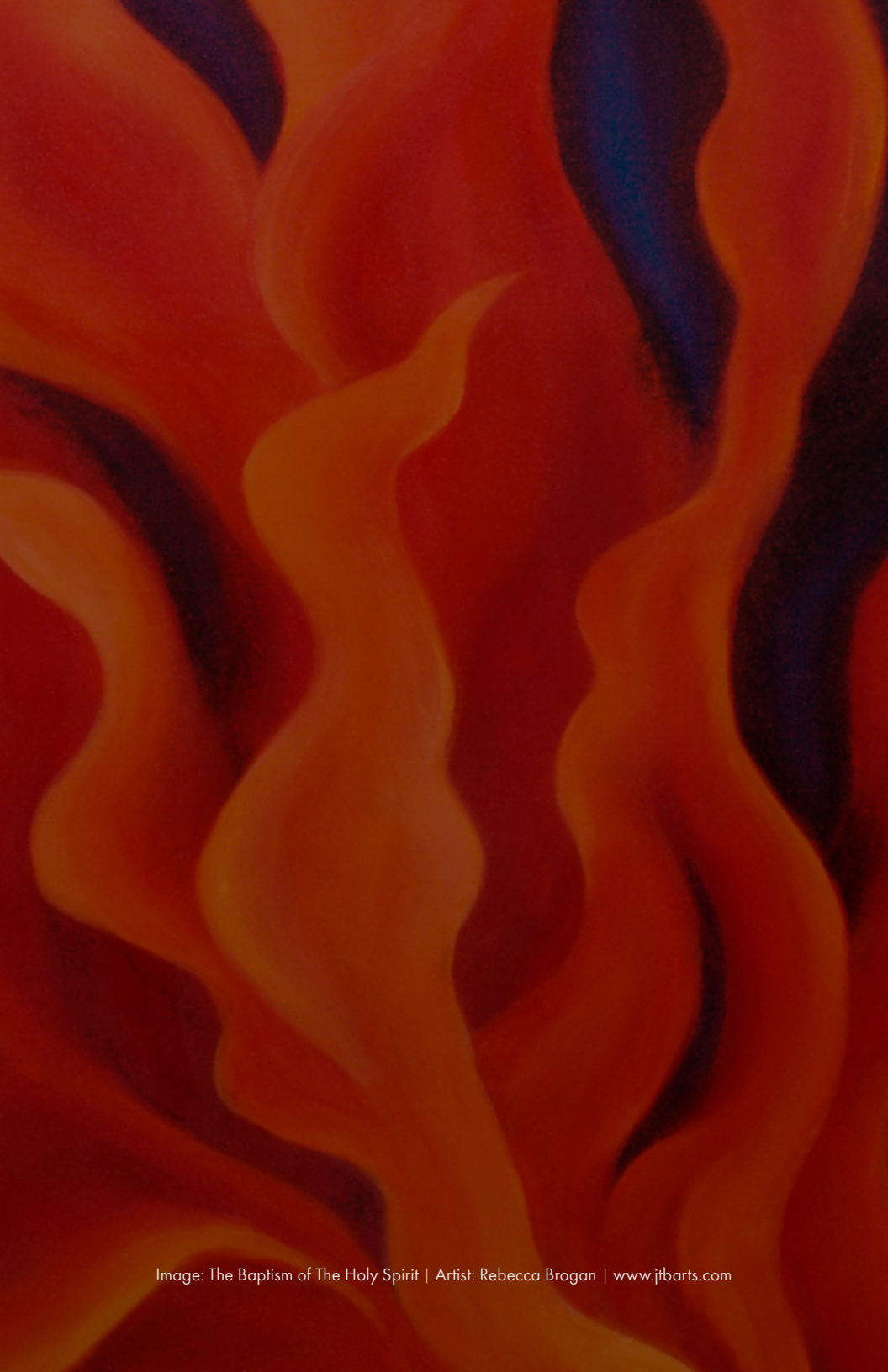
Image: The Baptism of The Holy Spirit | Artist: Rebecca Brogan | www.jtbarts.com