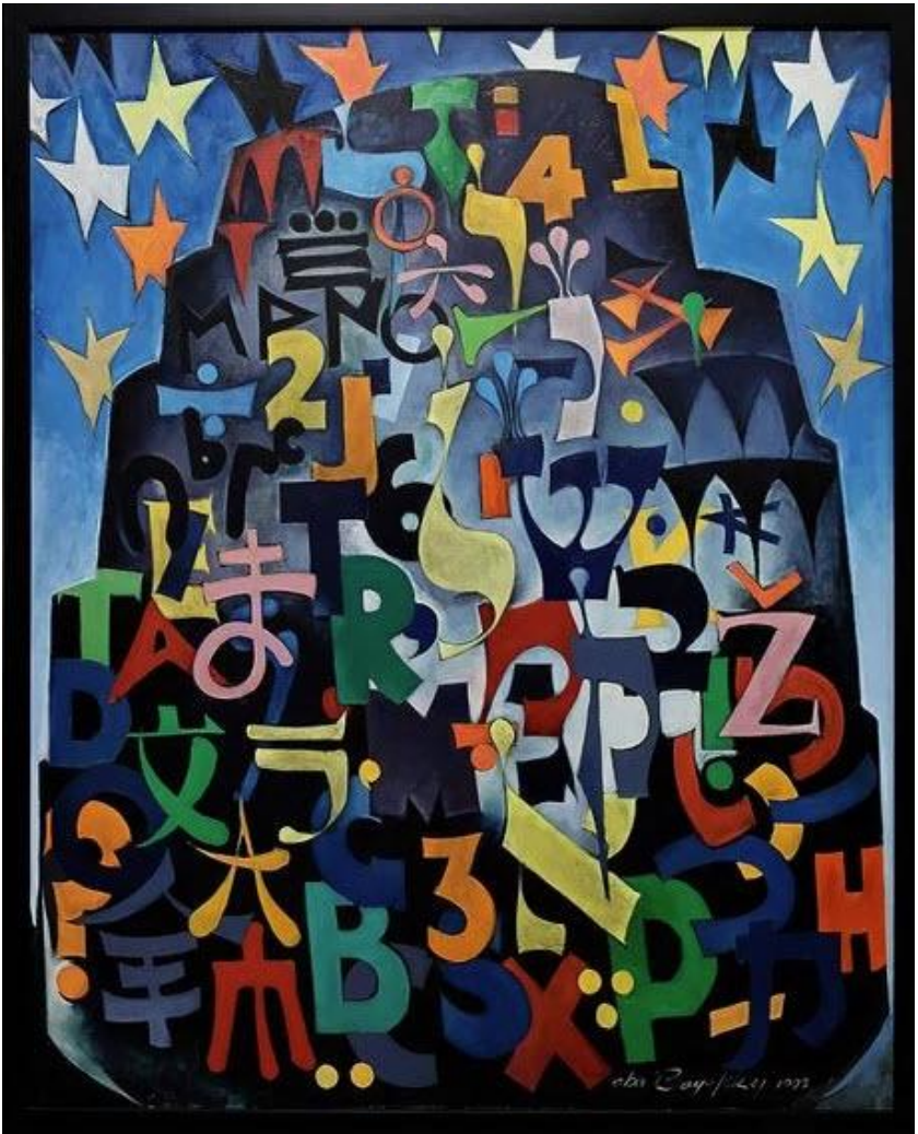
The Tower of Babel by Aba Bayefsky