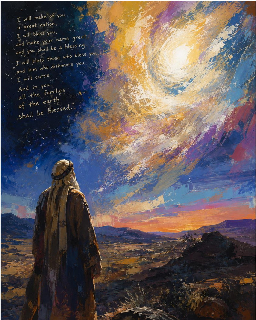
God's Covenant with Abram by Anonymous