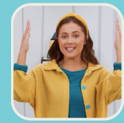
He made us,