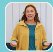
the sheep of his pasture.