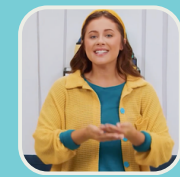
and we are his—his people,