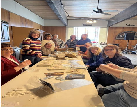
Packing Easter Boxes