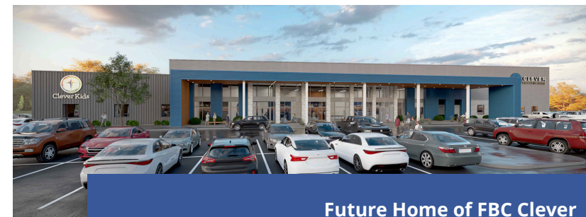
Future Home of FBC Clever