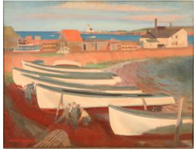
L'HaRMaS by the Sea! June 19 & 20, 2026

You're invited to a special evening of worship and fellowship on Sunday, June 14th at 6:30pm . Come together with our community for an inspiring time of music, prayer, and reflection. All are welcome to attend this meaningful gathering. Mark your calendars and bring a friend! We look forward to seeing you there.