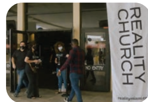
Reality Miami is reaching people for Jesus in a cross-cultural setting in one of the most strategically international cities in the world.

Just 50 miles south of us, Miami is one of the most diverse, and influentially international cities in the world. Yet under 10% of Miamians have a relationship with Jesus. Reality Miami is a new church reaching people in one of Miami’s fastest growing communities, just steps away from the University of Miami.