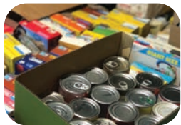
Over 220 pairs of shoes and thousands of meals have been donated to children and families.

We are a church that serves the “least of these.” Over the last year our church has been able to meet needs in unprecedented ways – providing thousands of meals, blood donations, daily necessities, and shoes to children and families in need. 2022 has been one of the greatest seasons of community impact in the history of our church. And we want to STEP UP our impact even more in 2023!