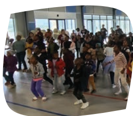
Children have needs met, receive a Christian education, and further their faith, positively impacting their community.

In 2023 we will launch a new partnership with Hope Schools and Care Center in South Africa to help children living in poverty who have been impacted by the HIV/AIDS and Covid pandemics.