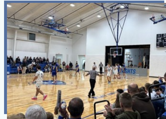
Everyone enjoying the large space the new gym provides for their various sports