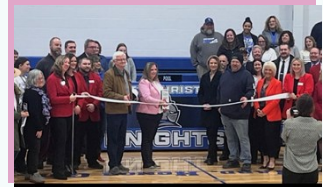
Ribbon cutting ceremony