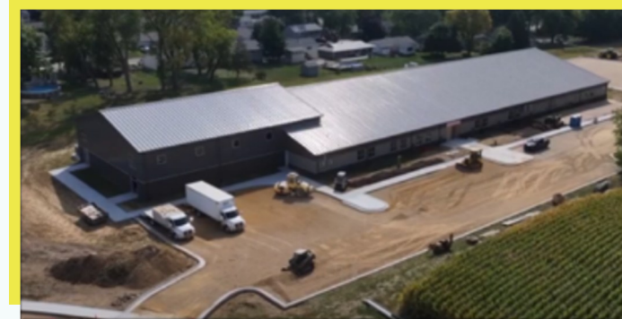
Aerial view of the Clinton, IA campus