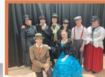
Drama Club performed Sherlock Holmes and the case of the Jersey Lily