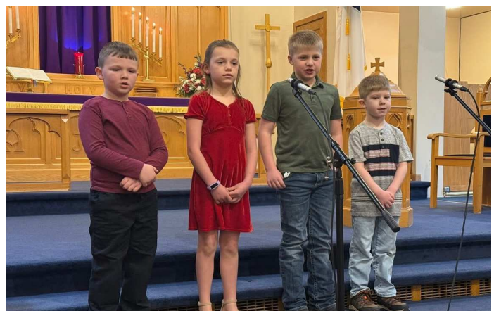
Preschool—2nd graders shared their memory work March 8.

On March 22 the 3rd grader recited the books of the New testament; 4th graders recited books of the Old testament; 5th graders recited the 23rd Psalm and 6th graders shared the Apostles' Creed.