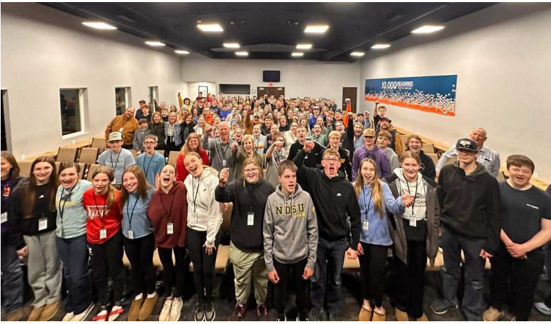
Our 7th grade confirmation class attended the Confirmation Retreat along with over 100 others kids at Vining MN, Feb 27-Mar 1.