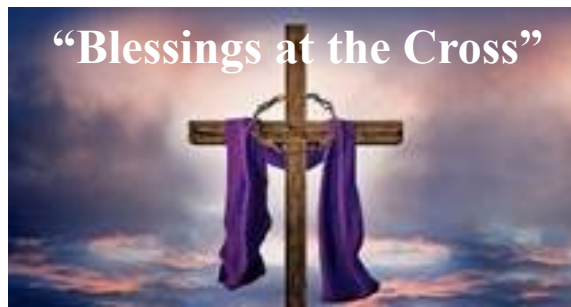
“Blessings at the Cross”

Then Peter said to them, “Repent, and let every one of you be baptized in the name of Jesus Christ for the remission of sins; and you shall receive the gift of the Holy Spirit.