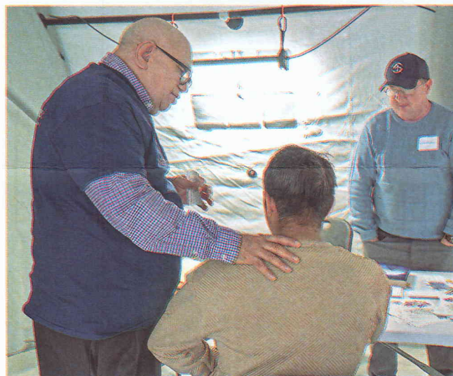
HELPING AT HOME: Samaritan's Purse is bringing medical, dental, and eye care to communities in need. Our outreach also includes praying for the hurting and sharing the Gospel with them.