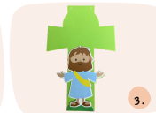
Place the Jesus sticker as shown in the picture!