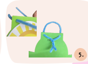
Insert a pipe cleaner through the holes and tie a knot.