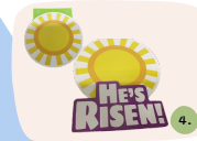
Place the sun sticker at the top of the cross, then add the 'HE'S RISEN' sticker as shown in the picture