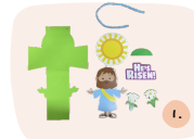
THINGS YOU NEED!