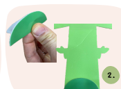
Peel off the sticker and stick it to the bottom of the cross.