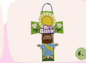
All done! Tada! You've made a beautiful reminder of the True Story of Easter!