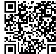
On Line Giving