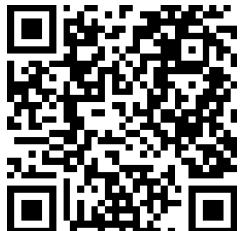
On Line Giving