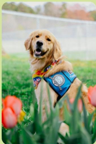
FAITH COMFORT DOG