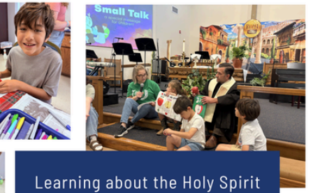
Learning about the Holy Spirit