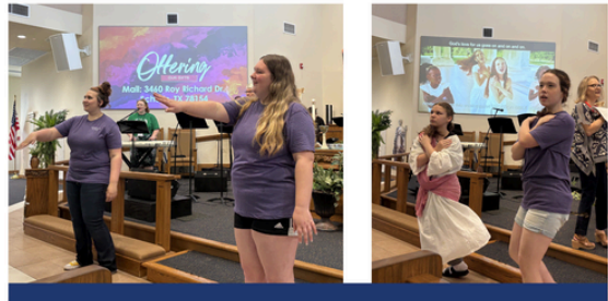
The youth demonstrating VBS dances