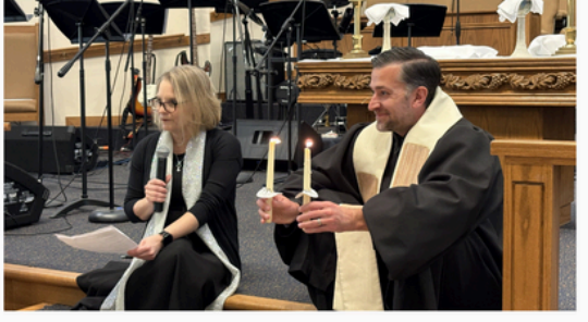
Always a good lesson during Children's Time