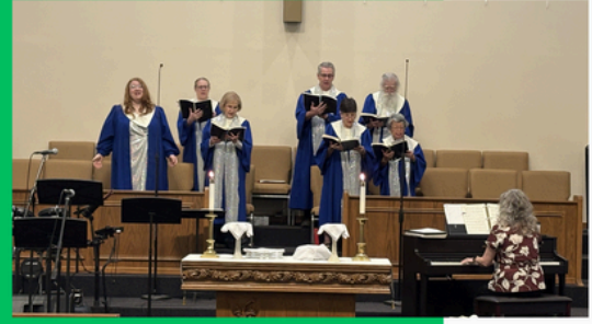
The Chancel Choir is sparkling on Transfiguration Sunday!