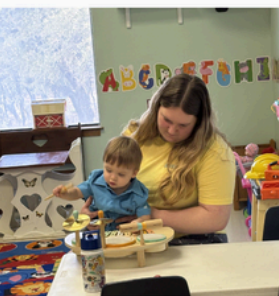
Watch out world... Future Drummer in the works!