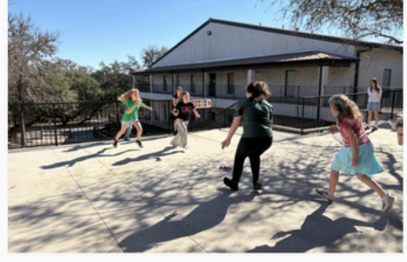
The youth strenghting their faith with a game