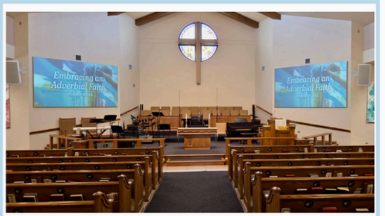
If you haven't noticed yet, our Sanctuary has had a bit of a refresh! New projector screens have been installed on the walls, along with new bulbs in the projectors—making everything brighter and much easier to see, from graphics to lyrics.