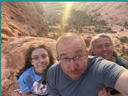
The Appleton Family