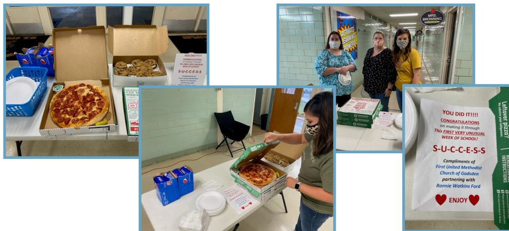
A Pizza Party to for Back to School Week from GFUMC partnering with Ronnie Watkins Ford

Along with the Beginning of School comes our FUNDRAISER to support our teachers at Striplin through the year. These funds will provide The Teacher of The Month Program (50.00 / month), Teacher of the Year (100.00) and the Teacher Appreciation Luncheon in May. Our teachers work so hard, especially now with Covid 19, so your support will enable us to say, “THANK YOU!” Please add a donation to your pledge, mail a check to the Church Office, or use e-giving to make sure we are able to provide a much needed “JOB WELL DONE!”