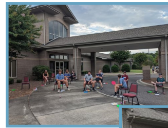
GFUMC Youth Group