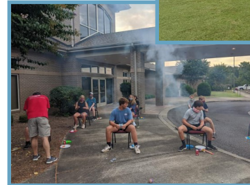
With Christ Central Youth Group