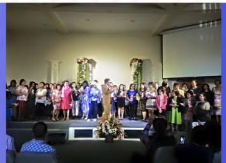
WBC Church Camp 2015