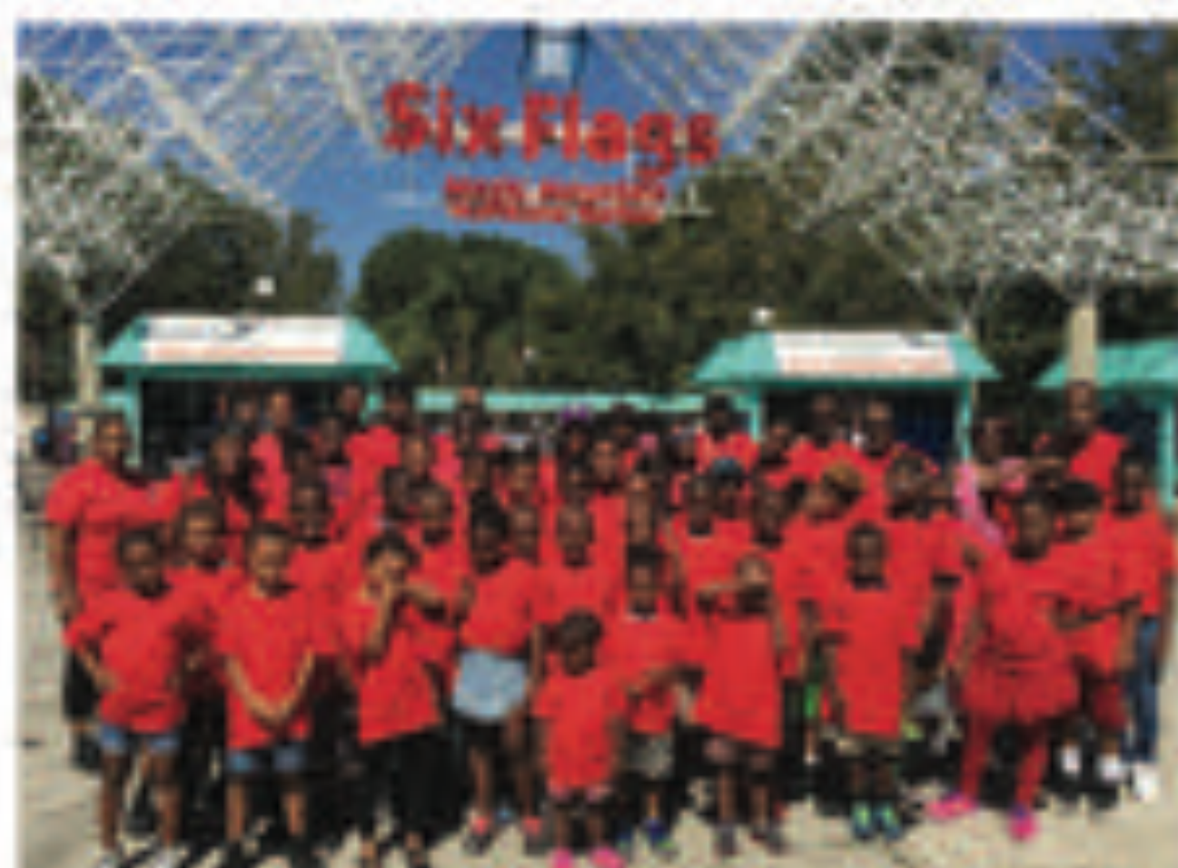
First New Christian Fellowship Missionary Baptist Church