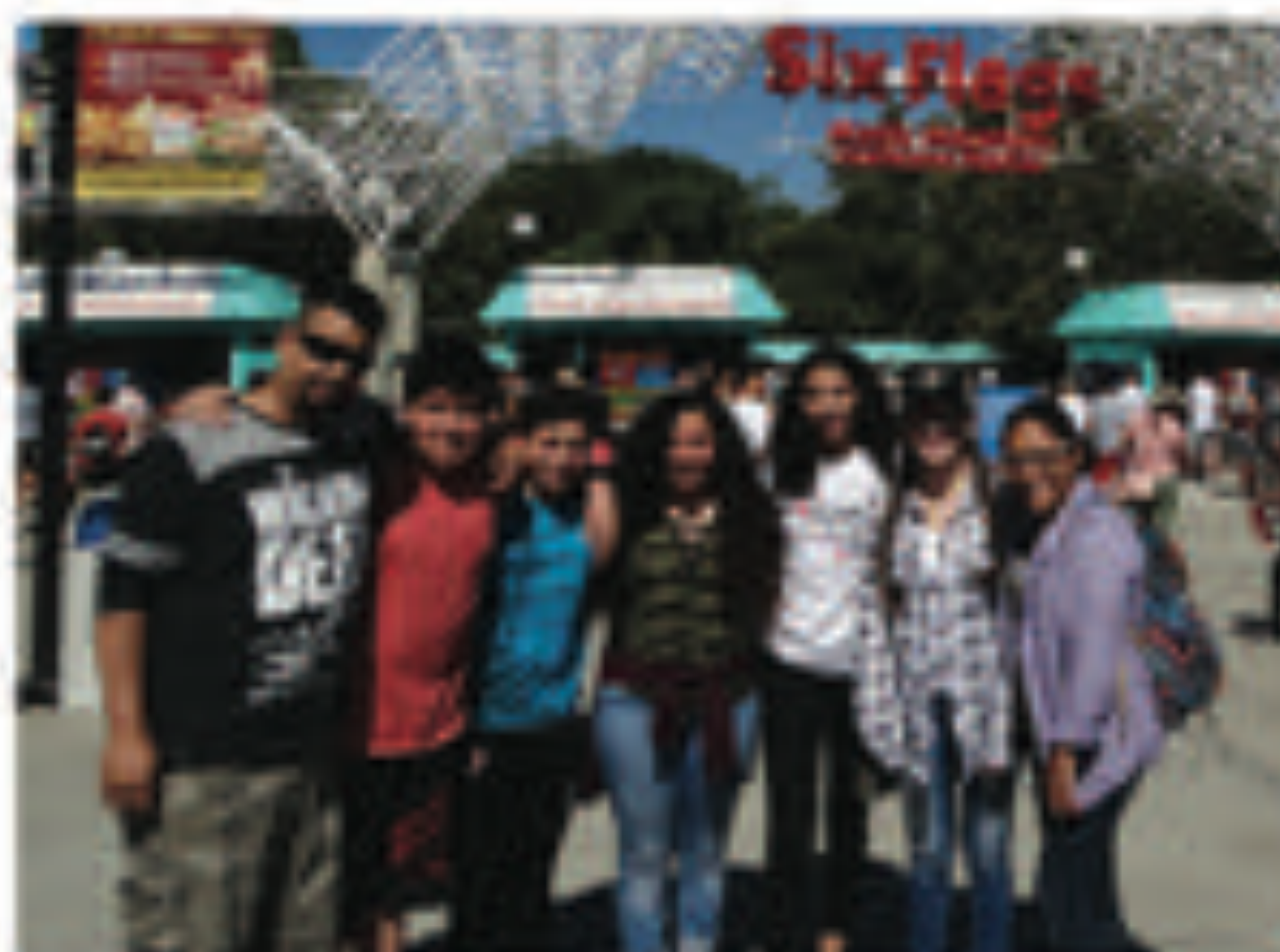
Iglesia Bautista El Salvador