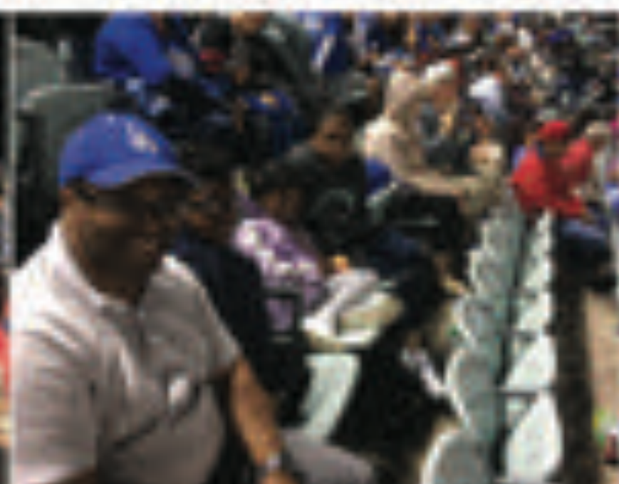
First Baptist Church of Los Angeles