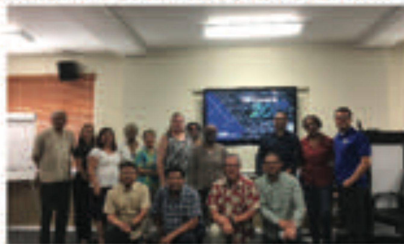
Global Leadership Summit Webcast group at the Regional Resource Center.

"Direct application for home, public service and ministry; overall increased leadership abilities, skills and tactics"