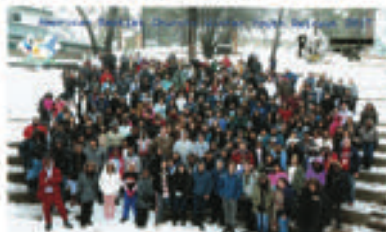
Small groups help students get to know each other.