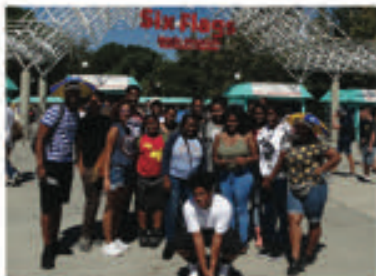
Park Windsor Baptist Church

Youth groups came to Magic Mountain to deepen their relationships with one another. A picnic was held during the middle of the day so the youth from different churches could connect with one another.