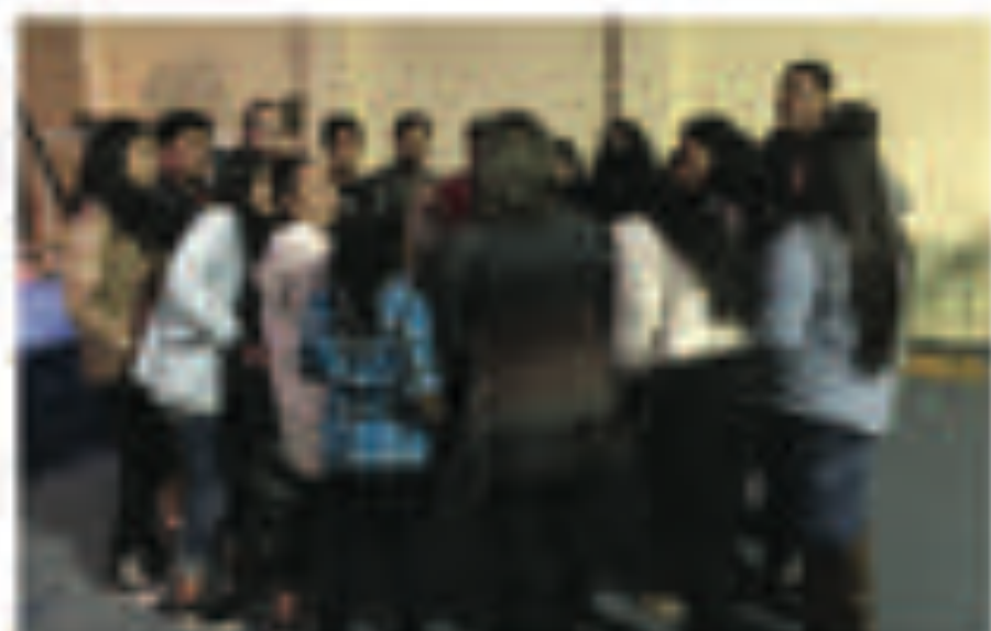
Crowd breakers before worship begins