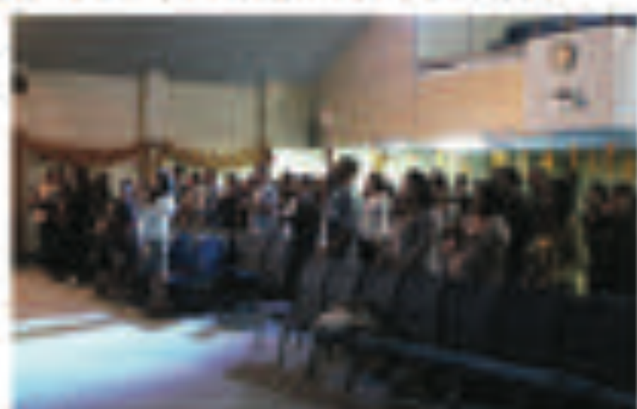
Gathering to worship!

Worship Nights - Coming together to worship our Great and Wonderful God! Festival - November 2017