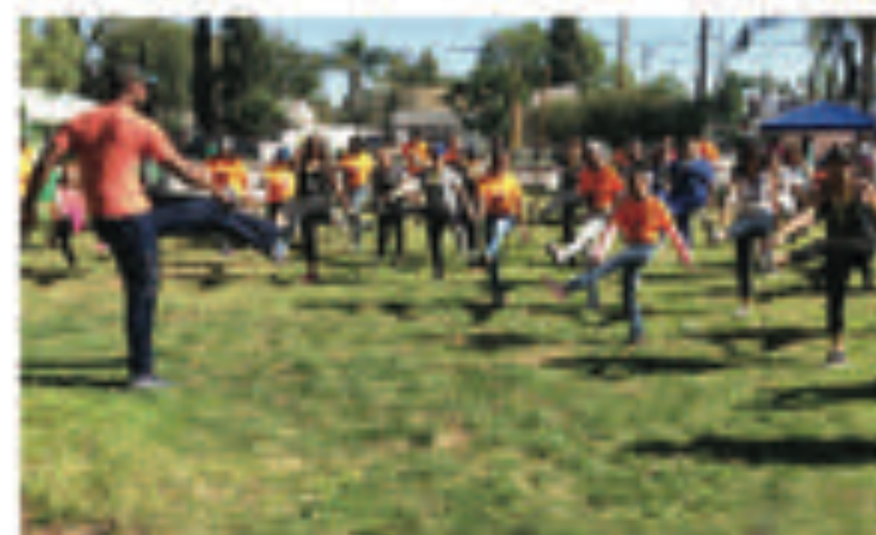
Hands4Hope LA Teens Volunteering at Jim Pickens' (from Grey's Anatomy) Rodeo Competition