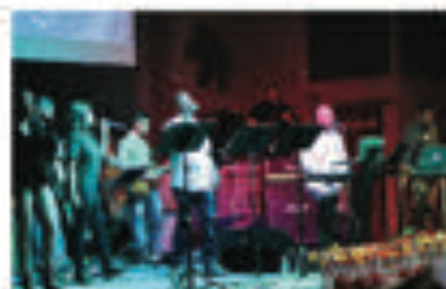
Come to the Altar - May 2017