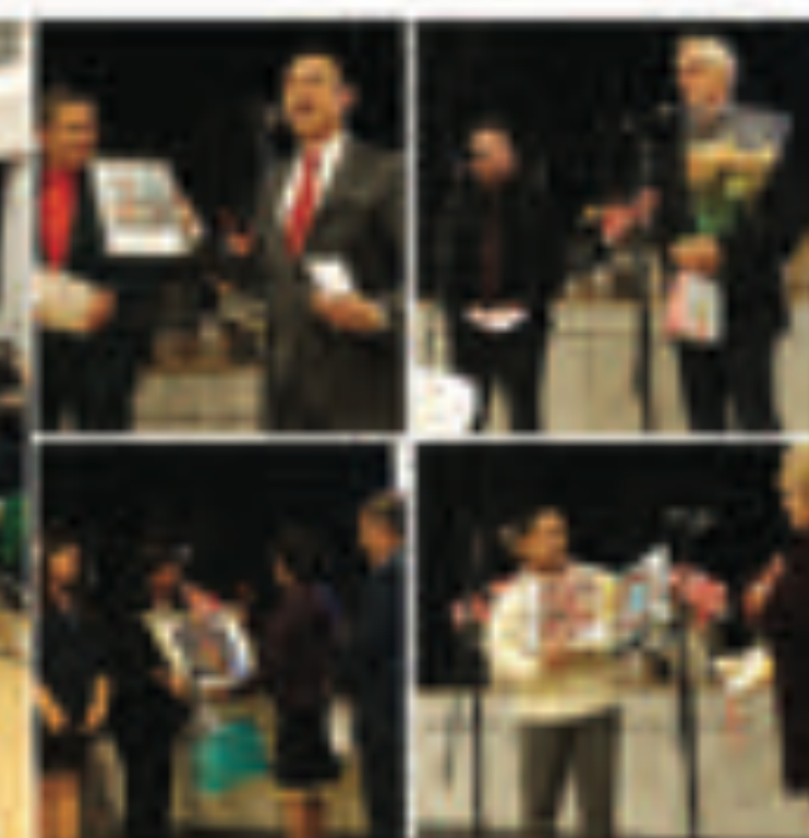
Churches were invited to participate in a gift exchange with one another.