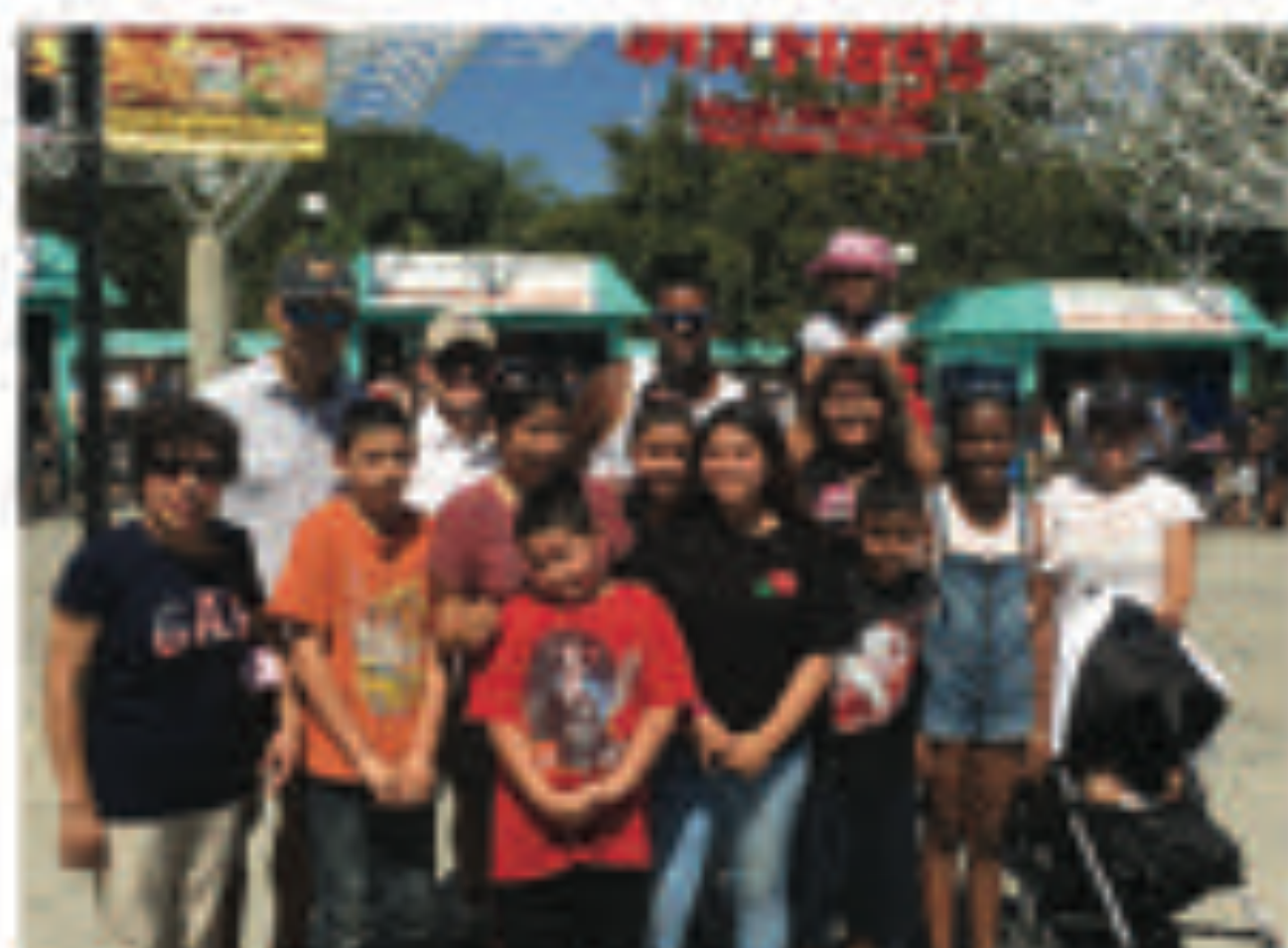
First Baptist Church of Los Angeles