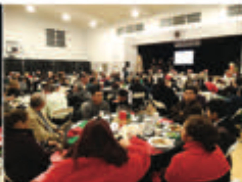
Everyone enjoyed a delicious dinner.