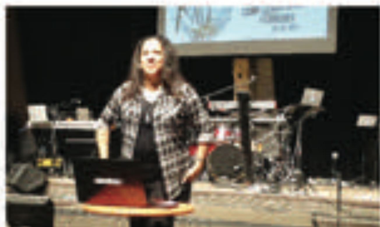
Worship is a highlight for many of the students who attend WYR.