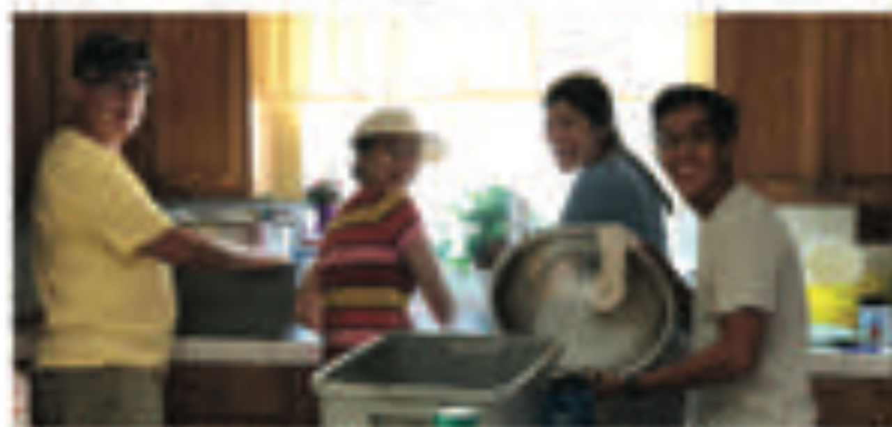
Washing dishes to give the women a break from their usual routine.