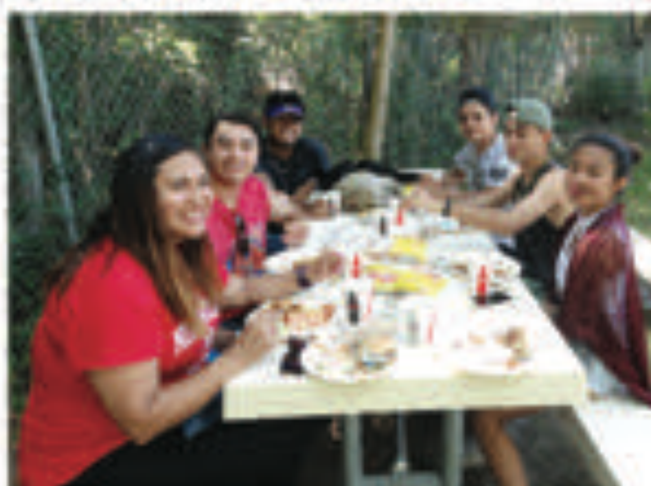
Enjoying the picnic together