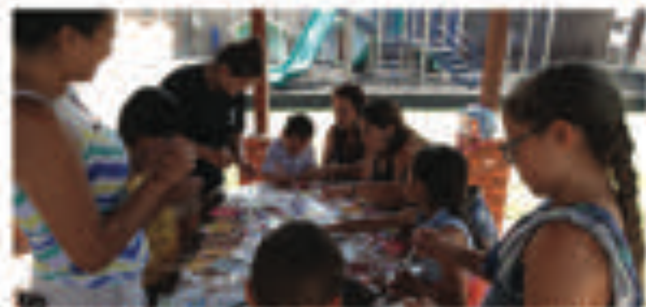
Creating crafts together with the mothers and their children.