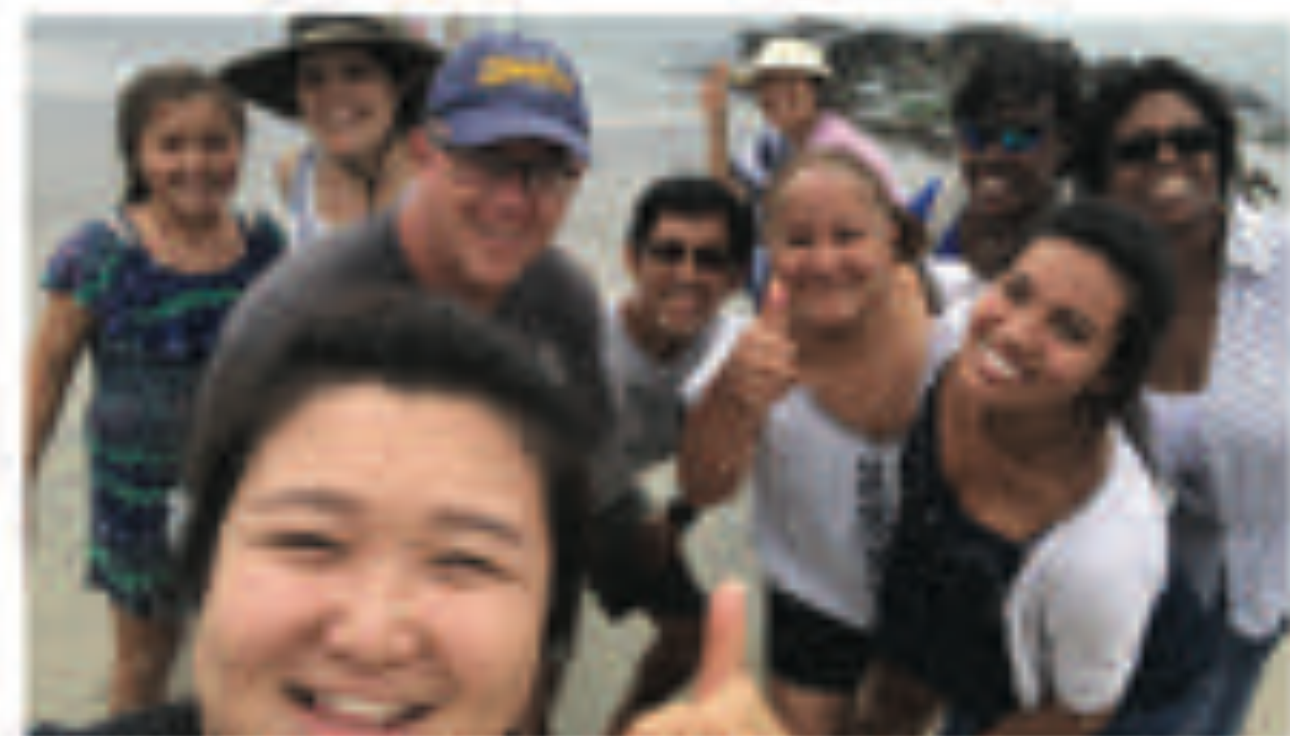
Deborah's House Team from ABCOFLASH.

Deborah's House - Labor Day Weekend 2017 - A team of nine from four churches traveled to Tijuana to serve with the women and families of Deborah's House. The team ministered to women and children who have experienced the trauma of domestic violence. A highlight, was joining with a Tijuana church, in a beach baptism that included two children of a woman who spent time at Deborah's House several years ago.