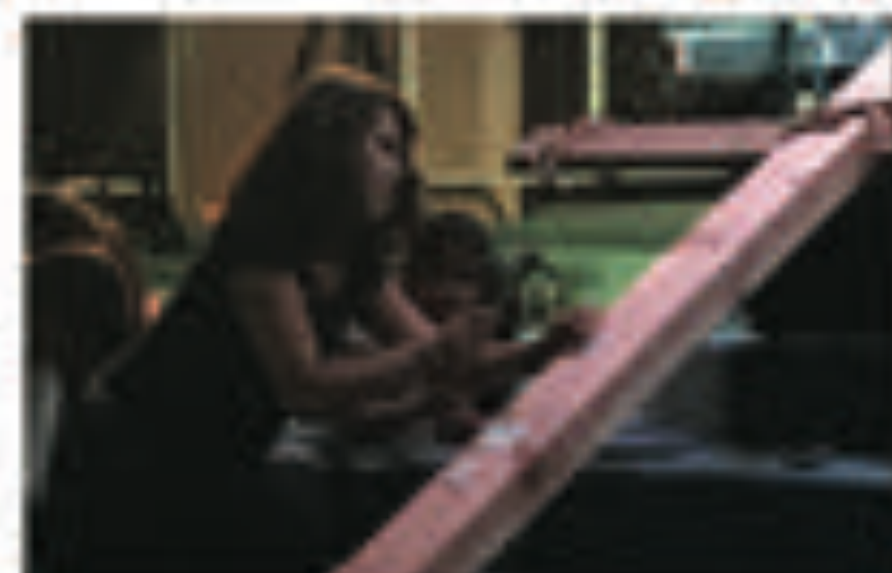
Nailing confessions and sins to the cross as we remember Jesus' sacrifice for us.