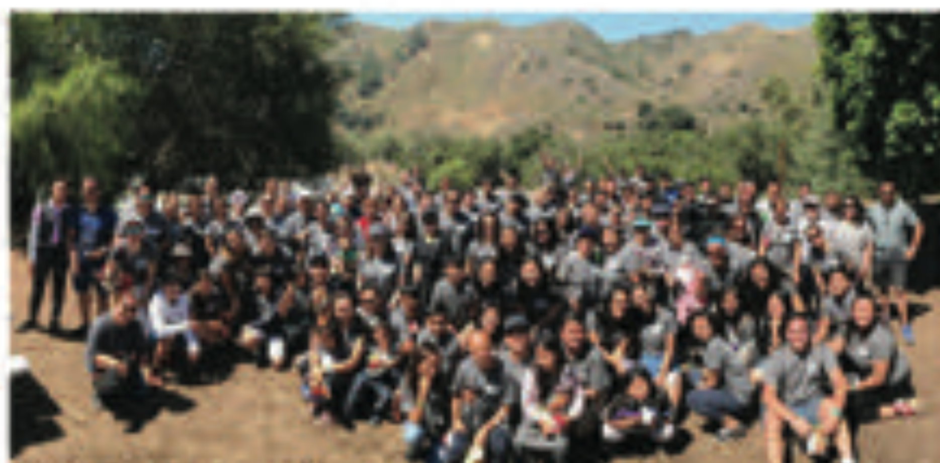
Wishine Baptist Church's Annual Camp 2017, "Guardians of the Faith" Celebrating their 105th Church Anniversary.

"Let the word of Christ dwell in you richly in all wisdom; teaching and admonishing one another in psalms and hymns and spiritual songs, singing with grace in your hearts to the Lord." Colossians 3:16