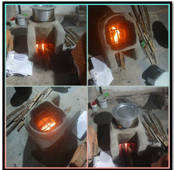
Cement wood stove made by CFMI children