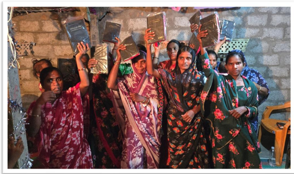
CFMI Bible distribution to new believer

Preach the message; be persistent in doing so, whether in season or out of season convince, reprove, and encourage, but with great patience and instruction. 2 Timothy 4:2