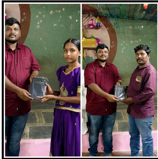
CFMI Bible distribution to new believer

Preach the message; be persistent in doing so, whether in season or out of season convince, reprove, and encourage, but with great patience and instruction. 2 Timothy 4:2