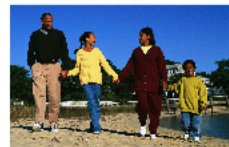
Revival Fellowship International Inc. Restoration Revival Tracts

Let's ask God for understanding of the work He is doing at this time and find our place within it.