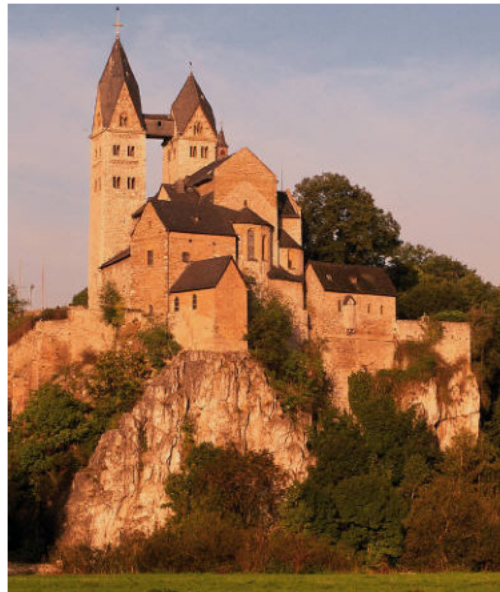
Revival Fellowship International Inc. Restoration Revival Tracts

I suggest reading Proverbs 21-30 frequently since these chapters deal with instructions to KINGS.