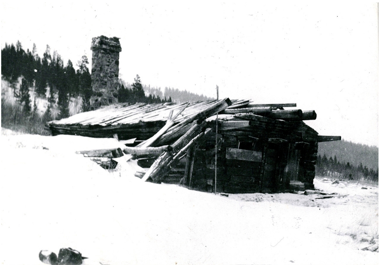
Buckskin Gulch. Tabor store.

Pic 1632