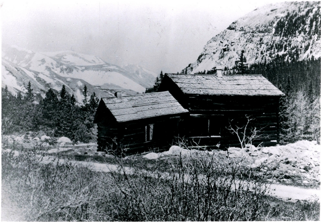
SILVER HEELS DANCE HALL 1950

Pic 1632