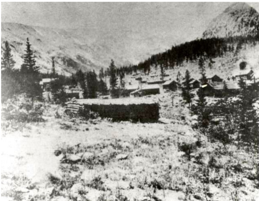
Buckskin Gulch. Town of Buckskin Joe. Saloon where Silverheels danced is half concealed building in upper left.

Pic 977