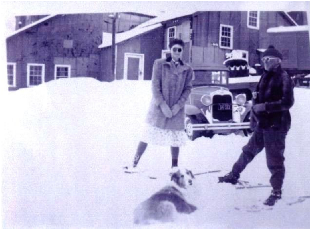
Paris Mill. Thanksgiving Day 1940.