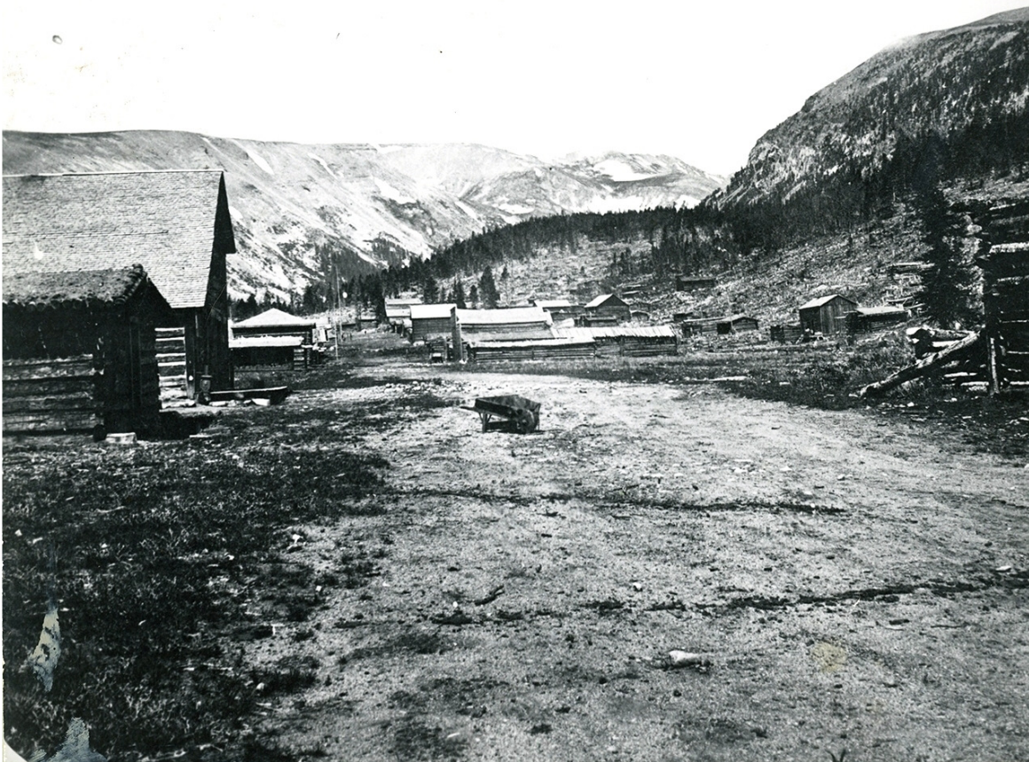
Buckskin Gulch - 1864 Pic 2180