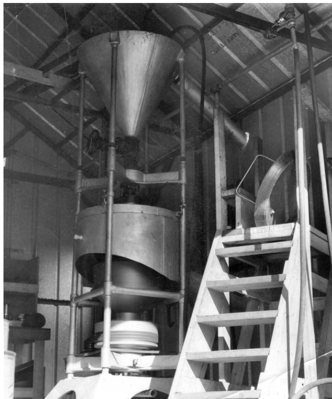
Paris Mill. August 1936. Alma Gold Placers, Inc.