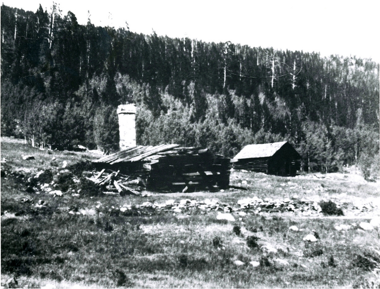
Buckskin Gulch. Tabor store. Pic 1637