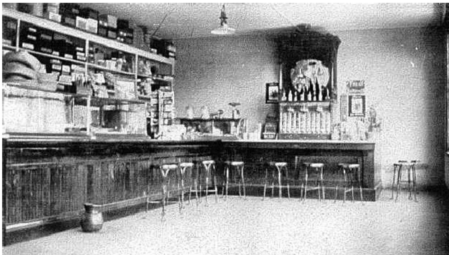
Circa 1920's Interior of Price Store