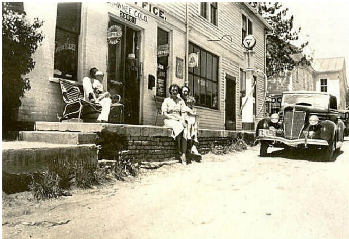
Shawnee 1936 - Front of Price Store & Post Office