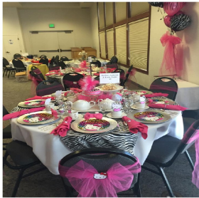
Annual "Sips for Soroptimist" Tea and Fashion Show