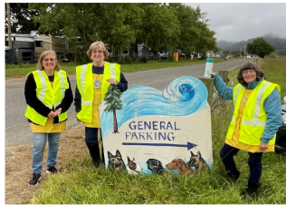
Volunteering: Lost Coast Kennel Club Dog Show Parking, Flags on Main Street, Highway Clean-Up