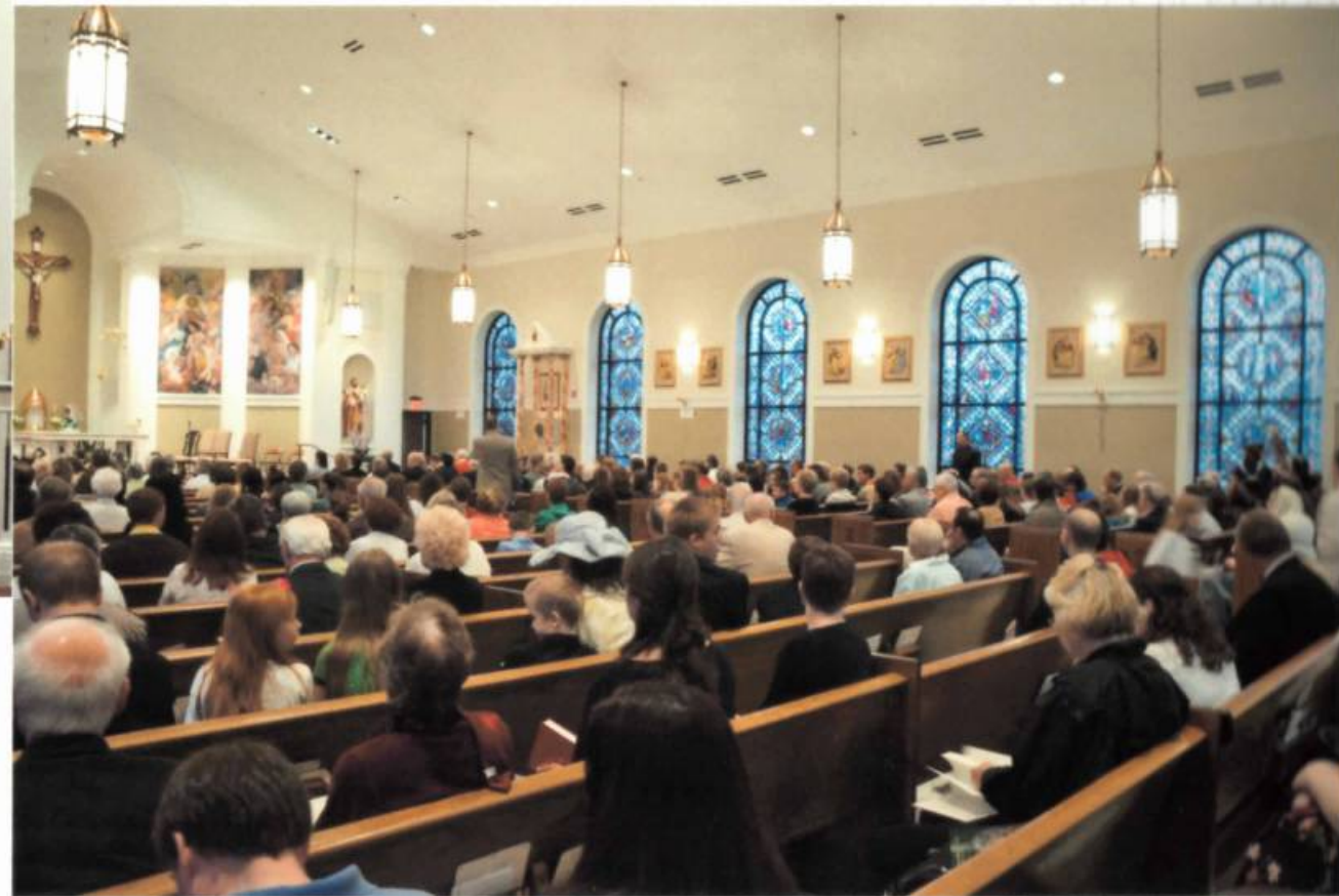
With a full house, the Dedication Mass was filled with dignitaries, clergy, and parishioners worshipping the Lord.