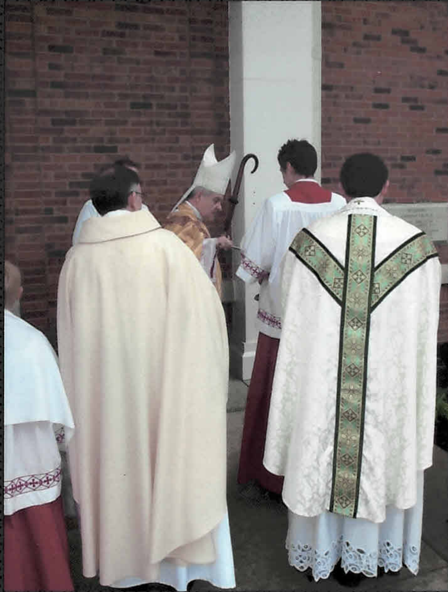
Archbishop Carlson blesses the outside of the church building.