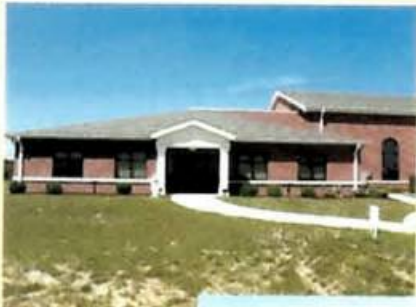
The Office and School entrance