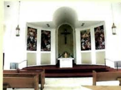
The sanctuary with a temporary altar