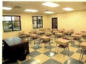
Classroom with desk and chairs