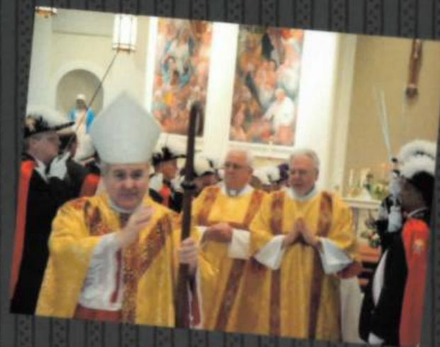
Archbishop Carlson blessing the congregation as he processes out of the mass.