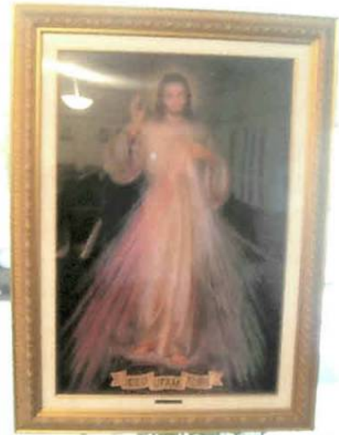
The St. Gianna and Divine Mercy reminders kept prayers flowing and thoughts of our helpers in mind.