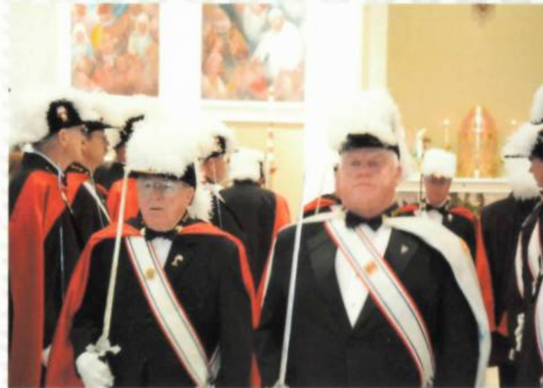
The 4th Degree Honor Corps Knights of Columbus Knights are from local Assemblies in the area.