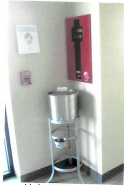
Holy Water Font