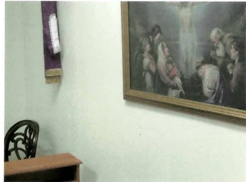
The Baptismal Font, Our Lady of Perpetual Help, the Confessional/Cry Room and Art- We had it all in our little church and we had a most sacred place.