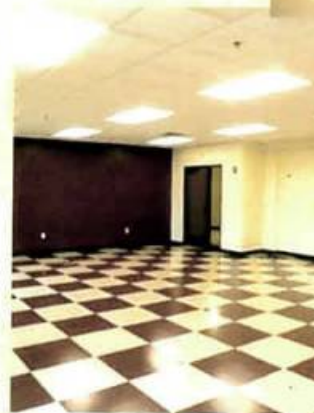
One of the classrooms