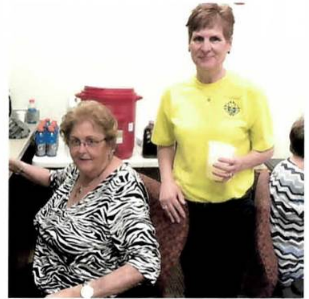
Union Break Time!