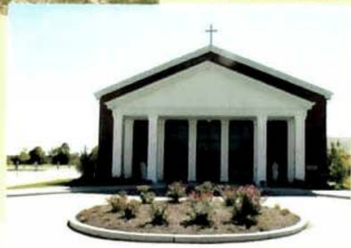
The front entrance of the new Church