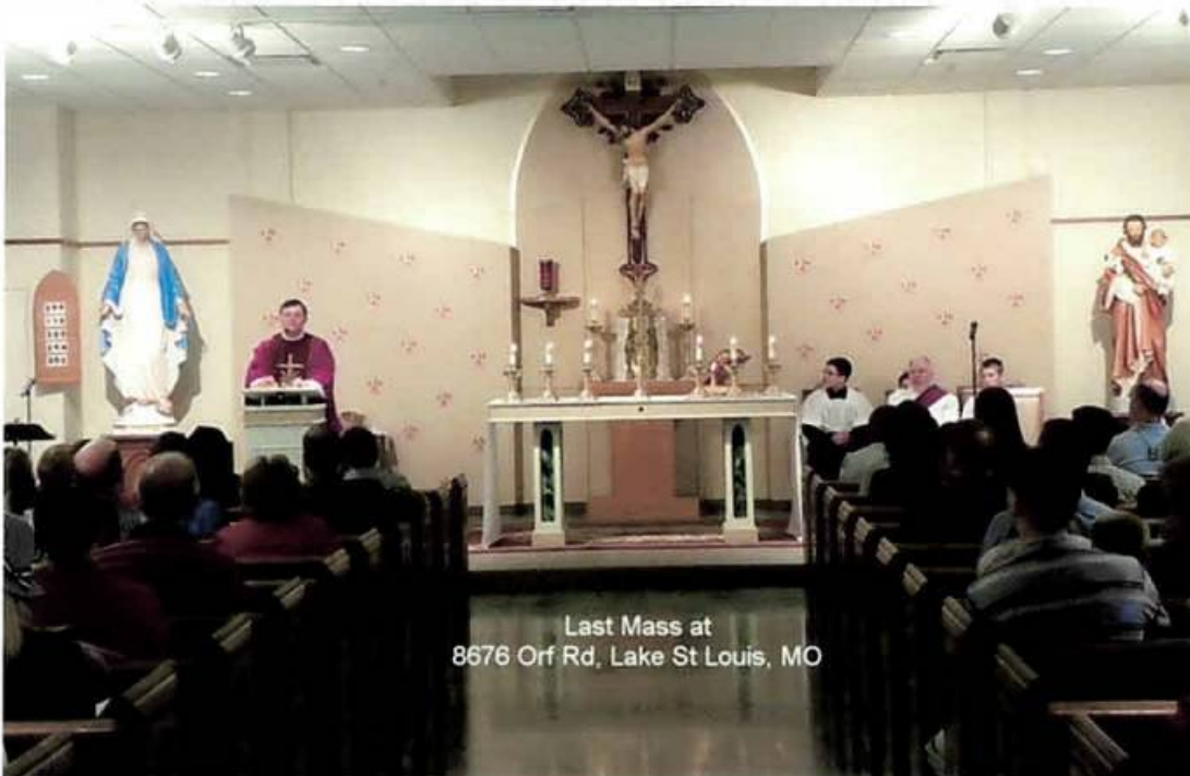
Last Mass at 8676 Orf Rd, Lake St Louis, MO

The last mass at Orf Road for St. Gianna Church- a sweet sorrow