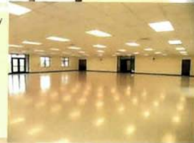
The "Commons" Hall