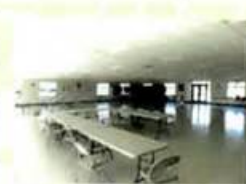
"Commons" Hall with tables and Chairs