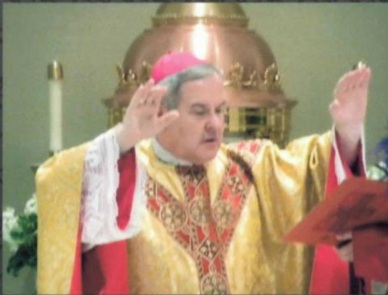
Archbishop Carlson Blessing the Building