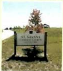
Driveway access off HWY N