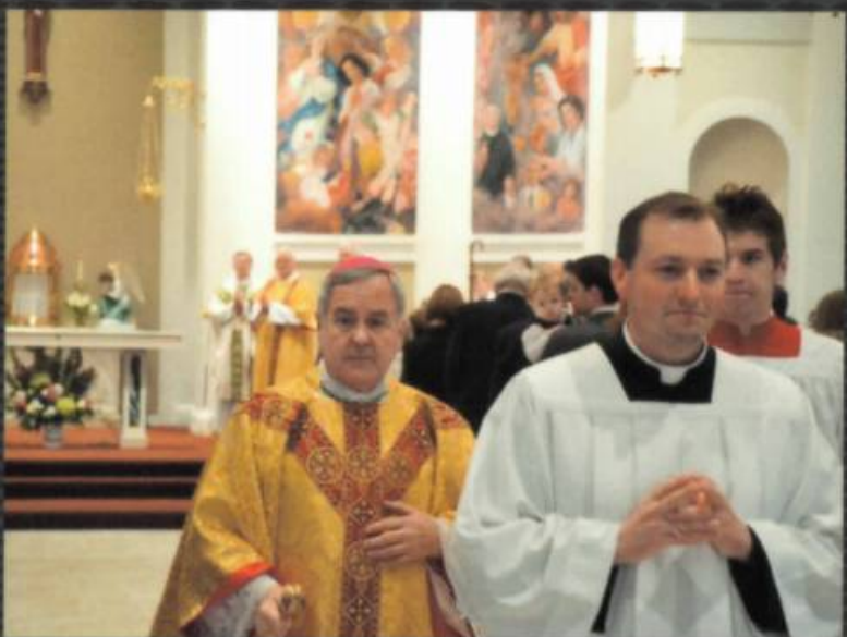
The Archbishop leads us in prayer and blesses all of us.