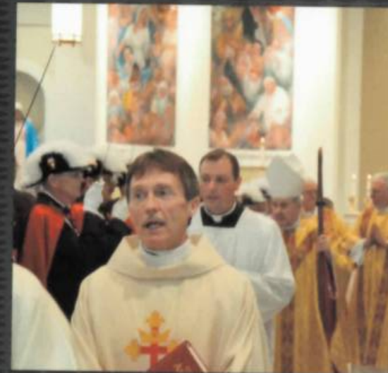
The final processional at the end of the mass.