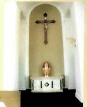
The Tabernacle and Cross