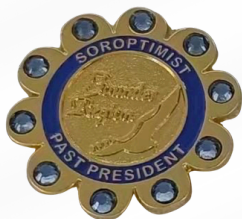
Past Presidents Pins $30