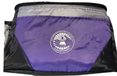
Cooler Bags $15.00