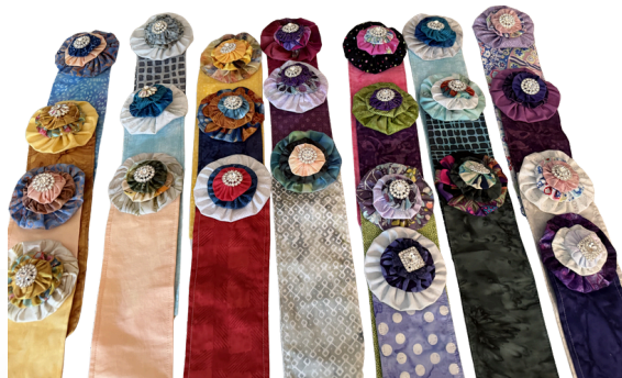
Pin Ribbons $25