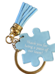
Puzzle Key Chains $5

All Proceeds go to Founder Region Fellowship Grant Program