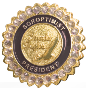
Presidents Pins $35

5, 10, 15 YR CHARMS AVAILABLE. ( CAN BE COMBINED TO = MORE YEARS) COMES WITH 1 CHARM. ADDITIONAL CHARMS $5.00 EACH. AVAILABLE $25.00 (QUANTITY DISCOUNT)