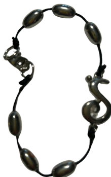
SI Bracelet $5