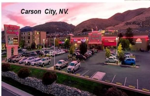
Carson City, NV

3rd Prize Fandango Casino Package Includes